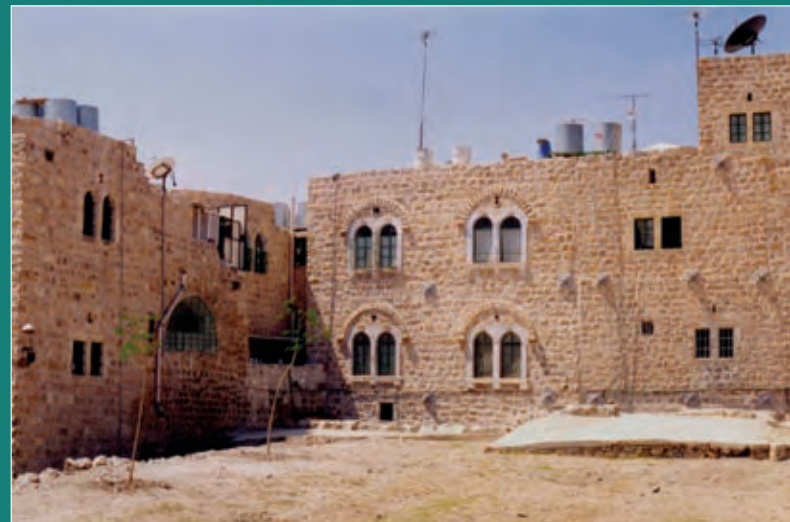
FIGURE 37 Hebron Old Town, rehabilitated quarters.