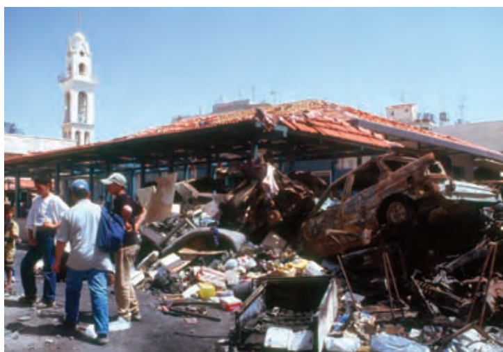
FIGURE 38 Bethlehem vegetable market, rehabilitated in 1998 and destroyed in 2002.

The only city in the West Bank that witnessed conservation work for no apparent political or religious reasons was Nablus. Nablus Municipal Council was keen to upgrade the infrastructure in the Old City market ( al-Qasaba ) to attract local tourists,