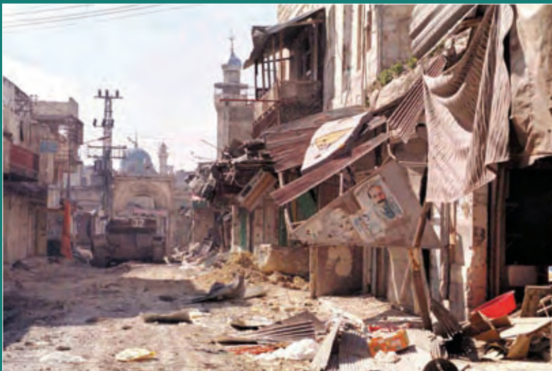
FIGURE 39 An Israeli tank in the Old City of Nablus, April 2002.

Even though the initial incentive for the conservation of the cultural heritage was politically motivated, as it stands today, there is a real interest in the protection and development of heritage for its own merits as