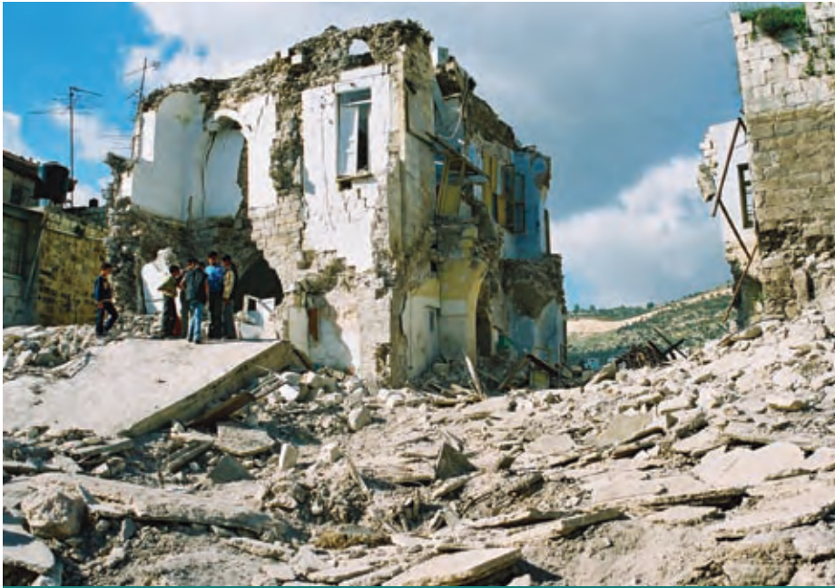
FIGURE 35 Old City of Nablus, destruction in April 2002.

The discussions about what is to be done in the vacant space created as a result of the destruction have not ended; ideas of reconstruction, erecting new buildings, and memorials are among the scenarios (Bshara 2005a).