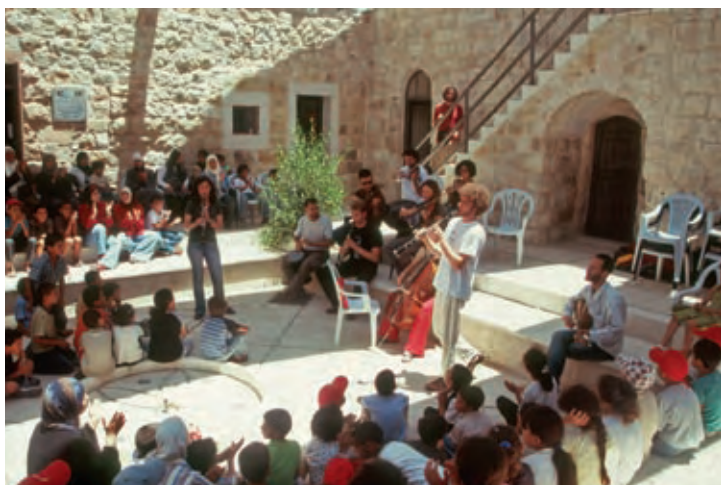
FIGURE 41 Recovery under fire: community activity in the renovated building of Beit Reema Cultural Centre.