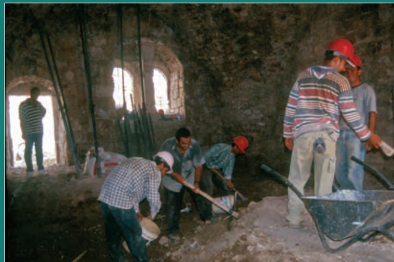
FIGURE 40 Job creation through restoration projects, 2002–6.